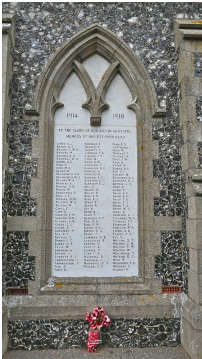
The War Memorial at Leiston Cemetery - please see overleaf.