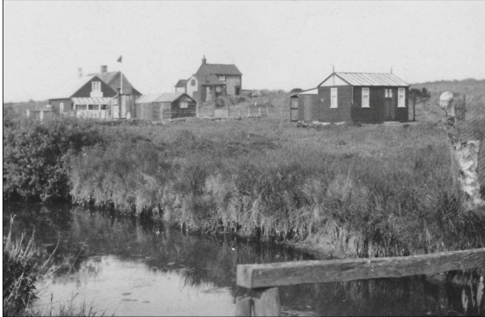
This picture shows one of the Sluice Cottages that were situated just South of the Sluice Well at Minsmere.

My Paternal Grand parents, between the two wars, had to vacate the Eels Foot Public House at Eastbridge due to trading difficulties. They next moved next to my Maternal Grand Parents at Carrs Cottages in Leiston where my Parents were first acquainted and, after a short spell The Ginger's and their family then moved to the Sluice Cottages from where my Grandfather cared for operations at the Sluice.