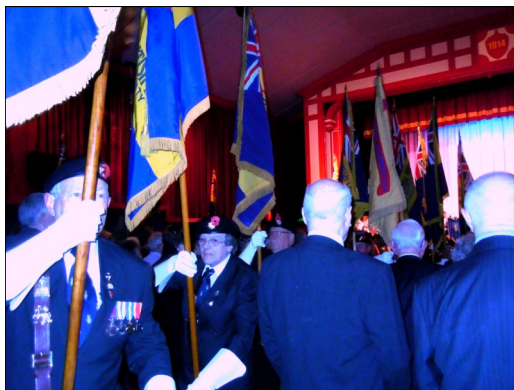
Parade of Standards at this year's Festival of Remembrance

The new year would start off very badly for me if I missed out on our local panto as they are always excellent and great fun.